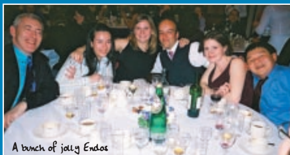
A bunch of jolly Endos